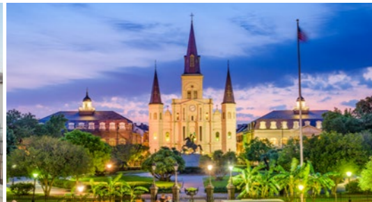
See the well-known St. Louis Cathedral