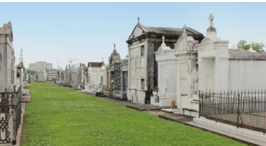
Visit Lafayette Cemetery for something different