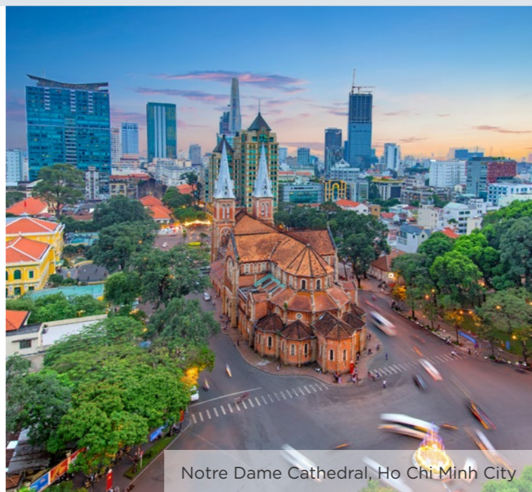
Notre Dame Cathedral, Ho Chi Minh City