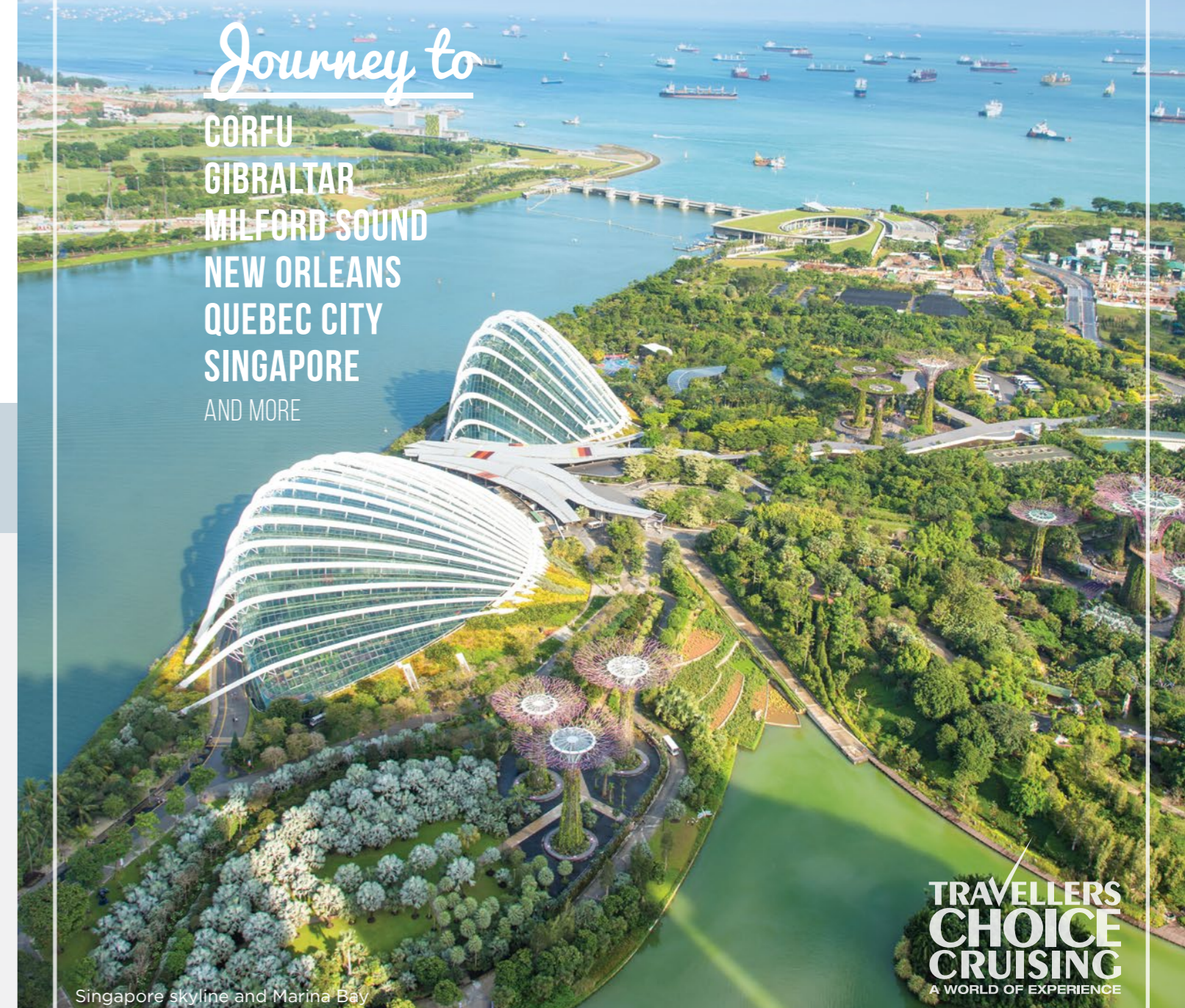
Singapore skyline and Marina Bay

CORFU GIBRALTAR MILFORD SOUND NEW ORLEANS QUEBEC CITY SINGAPORE AND MORE