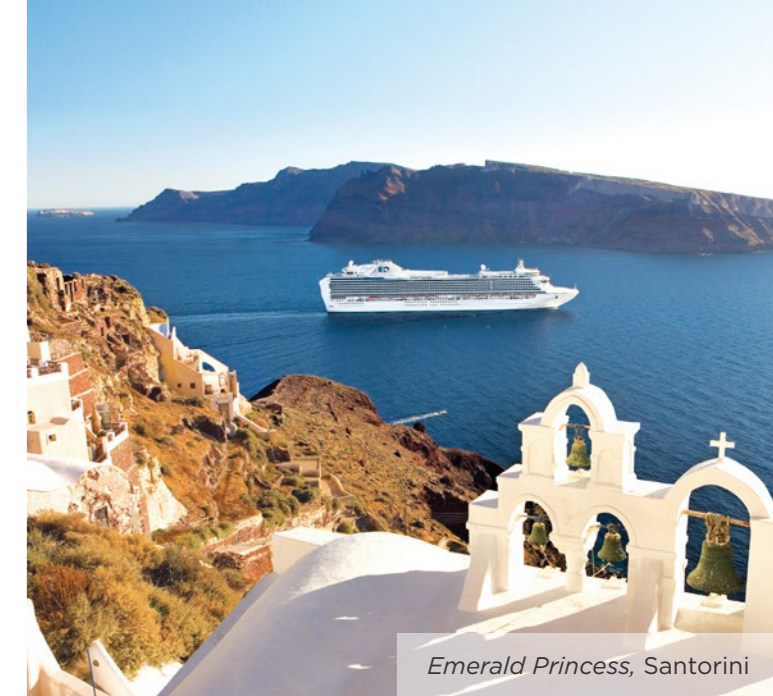
Emerald Princess, Santorini