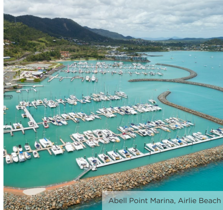
Abell Point Marina, Airlie Beach