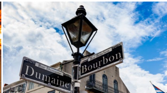
Stop for a drink on Bourbon Street